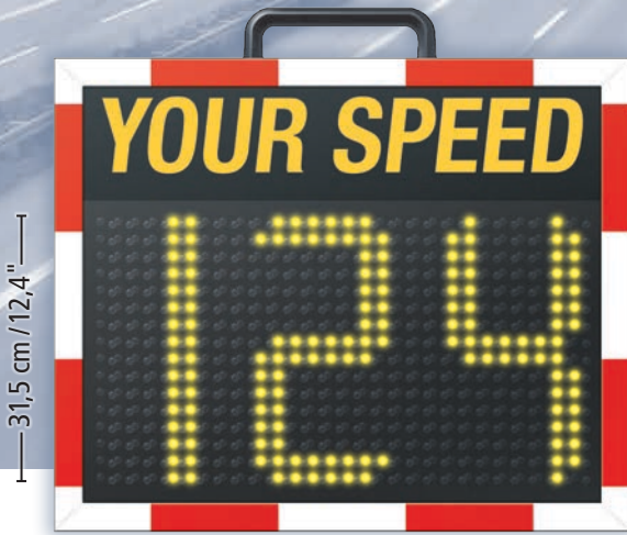
Dimension: 63,4 x 54,4 x 18,2 cm / 25" x 21,4" x 7,2" (W x H x D)