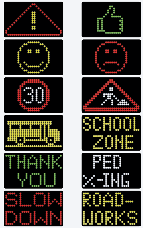
Available LED color combinations: amber-red / white-red / green-red.